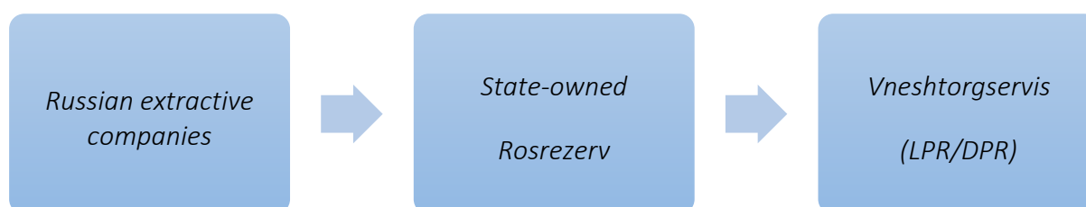
Figure 1. Russian iron-ore supply and transport scheme

In addition, Russian Railways has provided a 25% discount for transporting iron raw materials shipped to regions that are close to the LPR and DPR. According to media reports, the discount was created to support a scheme (see Figure 1) to help the DPR and LPR economies while guaranteeing that companies owned by Russian oligarchs would avoid lawsuits or sanctions. 31 Also, according to reports by Russian media, because of the amount of raw materials required for eastern Donbas companies, several other Russian firms, e.g. Metalloinvest and Severstal, were asked by the Russian government to consider supplying iron ore to Rosrezerv, a charge they denied. 32 Meanwhile, Rosrezerv received 10 bn of Russian roubles from the Russian government for the purchase of raw materials for the metallurgical industry. According to media, this replenishment of stocks was not envisaged for 2013-17. 33 In this way, the Russian Federation will supply the necessary amount of raw materials to keep 'nationalised' businesses afloat. Moreover, Russia is likely to support the sale of goods produced in the eastern Donbas.